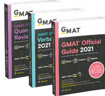
GMAT™ Official Guide Bundle 2021 9781119689652 | April 2020 Paperback | 1760pp | US$81.95