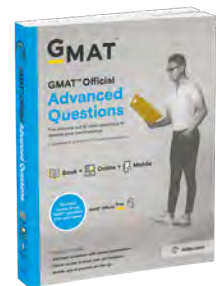
GMAT™ Official Guide Advanced Questions 9781119620952 | September 2019 Paperback | 336pp | US$29.95

The Graduate Management Admission Council (GMAC™) is the association of leading graduate business schools around the world. GMAC is the owner and administrator of the Graduate Management Admissions Test™ (GMAT™) exam, the first and only standardized test specifically designed for graduate business and management programs. Over 2,300 schools and in over 7,000 programs around the world use and rely on the GMAT for admissions to MBA and other graduate management degree programs.