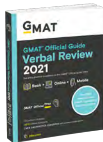
GMAT™ Official Guide Verbal Review 2021 9781119687887 | April 2020 Paperback | 480pp | US$20.95