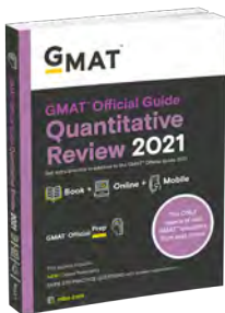
GMAT™ Official Guide Quantitative Review 2021 9781119687849 | April 2020 Paperback | 288pp | US$20.95